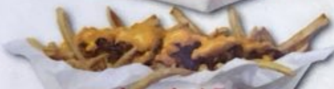
Loaded Fries Chilli - Cheese... 7.00 Chilli - Cheese - Bacon... 8.86