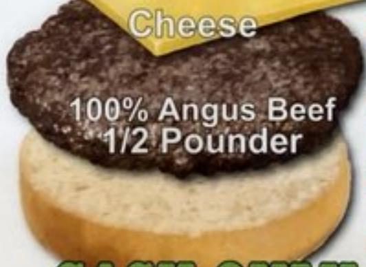
100% Angus Beef 1/2 Pounder