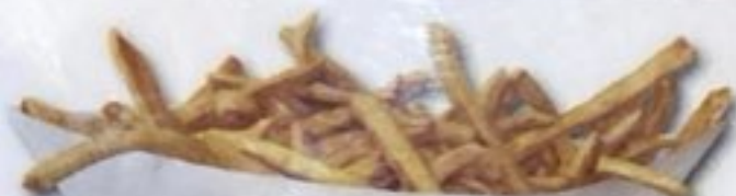
Flatliner Fries... 2.21