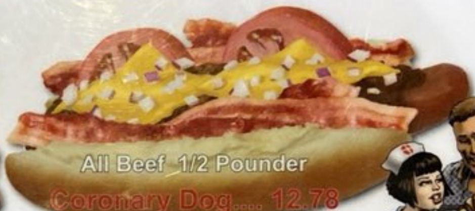
All Beef 1/2 Pounder