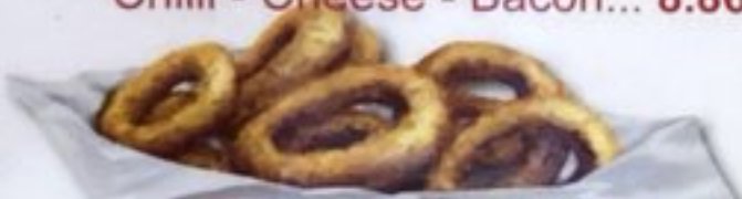
Onion Rings... 8.86 Chilli - Cheese - Bacon... 10.29