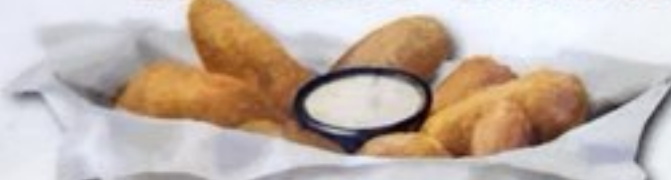
Jalapeño Poppers... 8.86