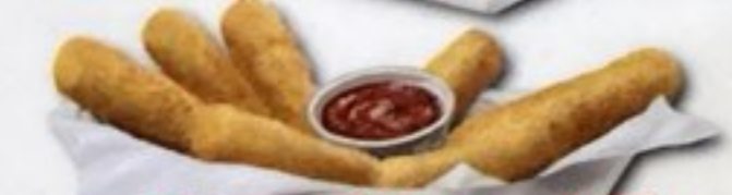
Cheese Sticks... 8.86

We'll happily split a Single, but DO NOT split or allow sharing of larger burgers!